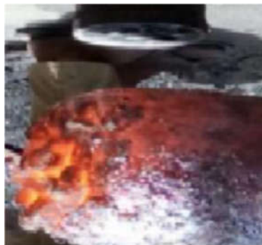
Figure 2: Pouring of Liquid MMC

The stirred liquid metal matrix composite further poured into to sand moulds of 20mm diameter and 1 foot of length as shown in figure 5.2.