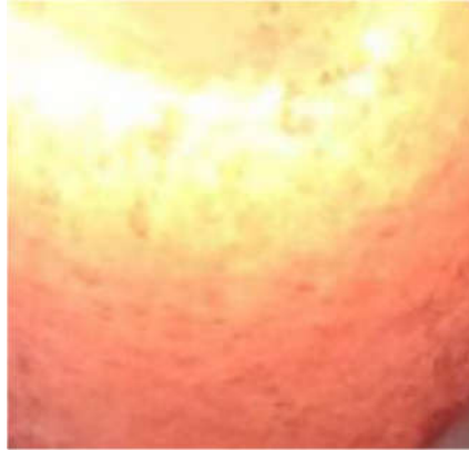
Figure 1: Melting of Aluminium Alloy 6082

Melting point of Aluminium Alloy 6082 is 550°C. In present work, first of the graphite crucible heated to 600°C for 10minutes. and work pieces of AA 6082 putted in the heated graphite crucible. Further it heated to 700°C for completely melt the AA 6082. It takes near about 20minutes.