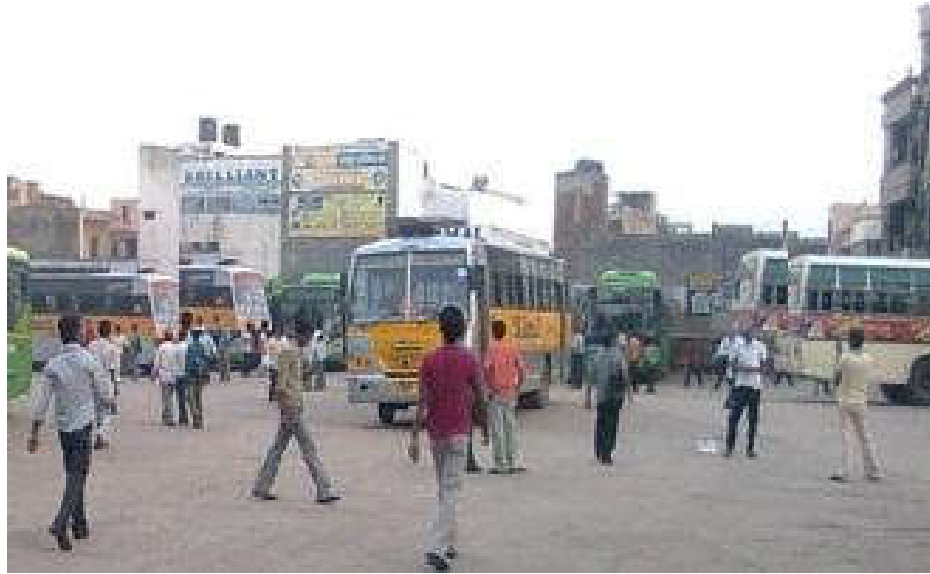
Figure 4: Rohtak Old Bus Stand Parking site for buses