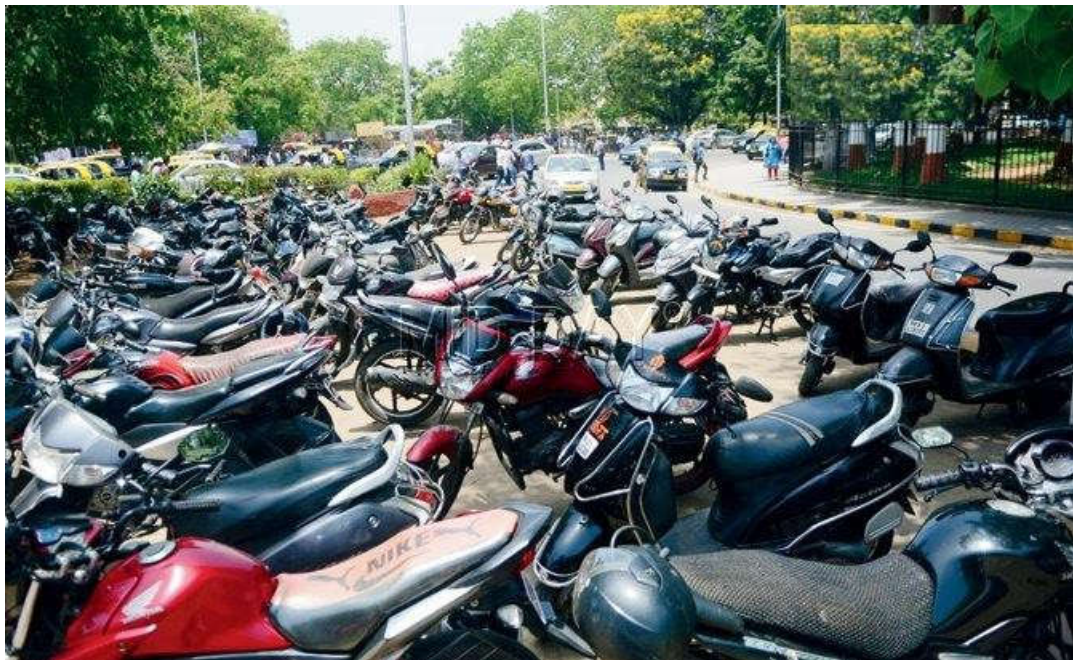
Figure 5: MDU Rohtak Parking site