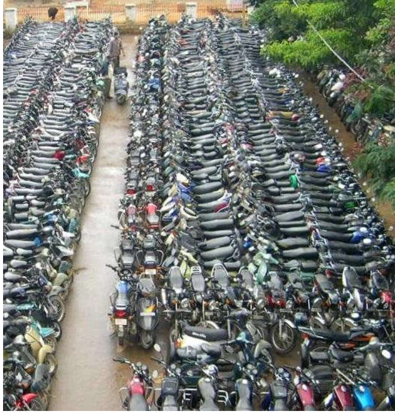
Figure 2: Rohtak Railway Station Parking site in day time