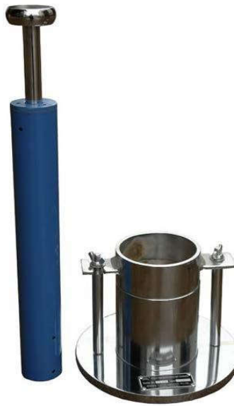
Fig. 2: Modified Proctor test apparatus

The graphical relationship of the dry density to wet content is then afthought considering the values found to ascertain the compaction curve. The determined curve comes in parabolic form and dry density worth is increasing up to a most limit and at that time once more the worth reduced. the utmost dry density is finally obtained from the height purpose of the compaction curve and its corresponding wet content, that is thought because the optimum wet content (OMC). Used formulas square measure listed below.